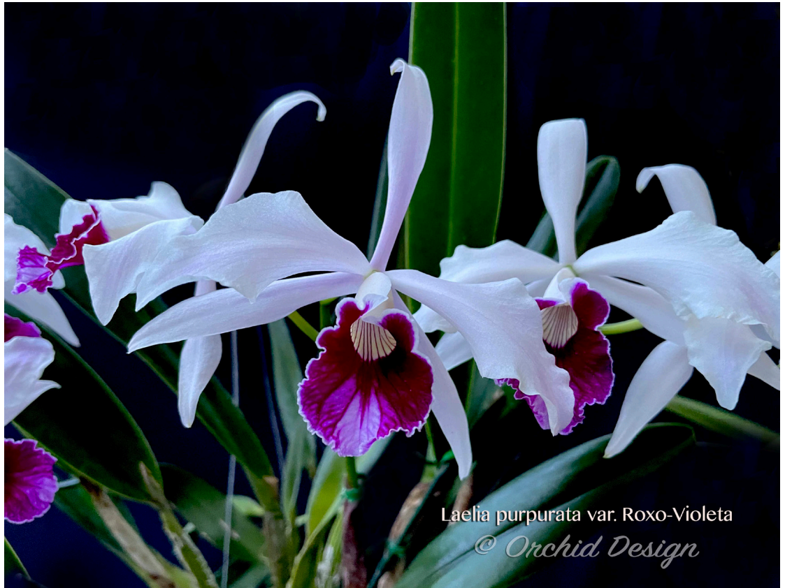
Laelia purpurata var. Roxo-Violeta

https://www.facebook.com/ORCHIDinSANJOSE/